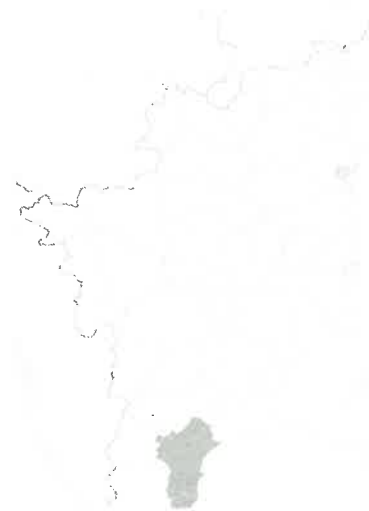
Map 1. Location map of Thoothukudi District

The district is a significant coastal region with a blend of urban and rural landscapes. It is having an important port city which is also a major industrial and commercial hub. The district features a diverse range of environmental elements, including coastal zones, arid and semi-arid lands, and a unique marine ecosystem.